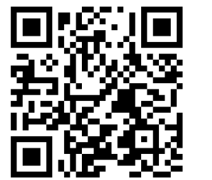
Learn More! View the TRCA website